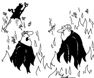
“I wrote assembly instructions for Children’s toys. What did you do?”

Get More Free Tips, Tools, and Services At Our Web Site: www.avagio.co.uk